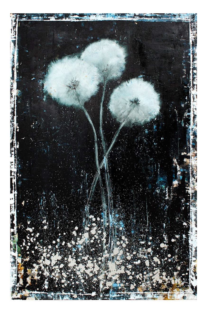
Matt Flint, "Beyond III," 55" x 36", Oil and Mixed Media on Panel, 2023